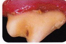
Stage 3: Moderate periodontal disease