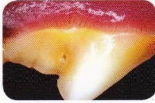
Stage 1: Gingivitis

Approximately 80% of dogs show signs of gum disease by age three* Periodontal disease has been linked as a risk factor to heart, kidney and liver problems in dogs**