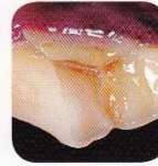
Uncomplicated crown-root fracture