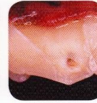
Complicated crown-root fracture