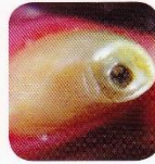
Complicated crown fracture