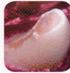
Uncomplicated crown fracture