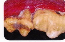
Stage 4: Advanced periodontal disease