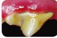
Stage 2: Early periodontal disease